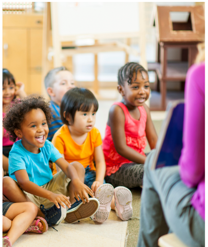
Engaging librarians in the science of reading

Recommended best practices for librarians include knowledge of integrating literacy development into programming design and delivery, such as that provided in this training (Association of Library Services to Children, 2022). Future research includes expanding to libraries who serve vulnerable communities and developing sustainable materials that can be used for librarians to engage in continued learning in an asynchronous manner.