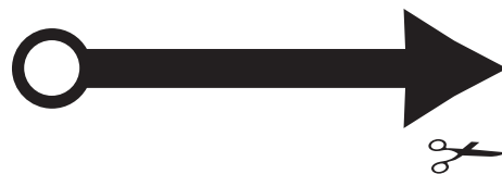
r-controlled vowel spinner